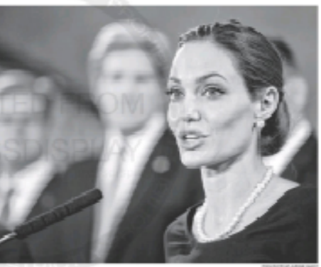
Jolie kept her commitment through the opening, including a trip to London for the April 2013 wedding.

Jolie's reveal 'smart, useful' - The revelation that Angelina Jolie has had a mastectomy is a smart and useful move.